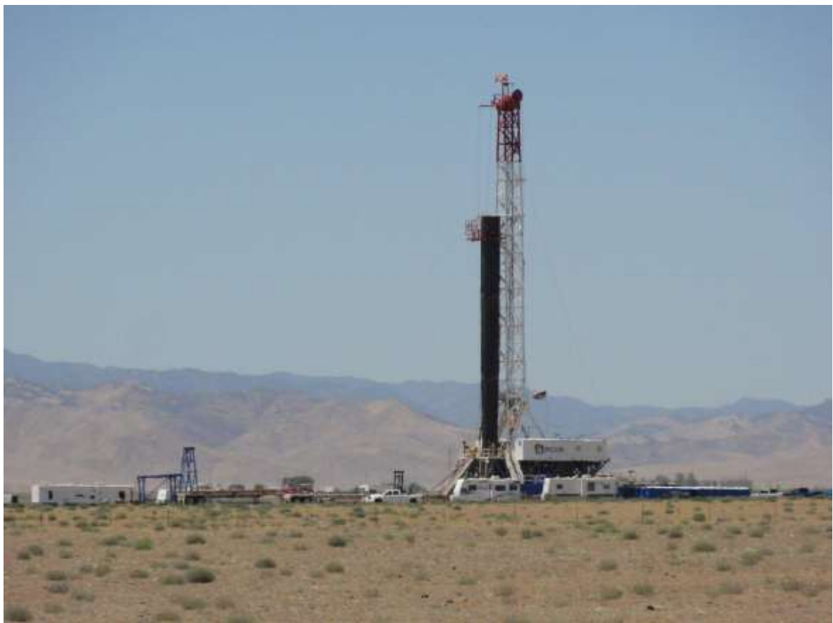
Graham Drilling Rig #5

The current drilling rig will be released tomorrow and in the next 2-3 weeks a smaller workover rig will be brought in to conduct a flow testing programme to determine whether oil can be produced from the well.