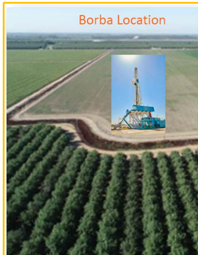
Borba 1-7 Well Pad Site

A comparison of key characteristics of the Perth Basin and the Sacramento Basin shows the many advantages of the Sacramento Basin as an investment location.