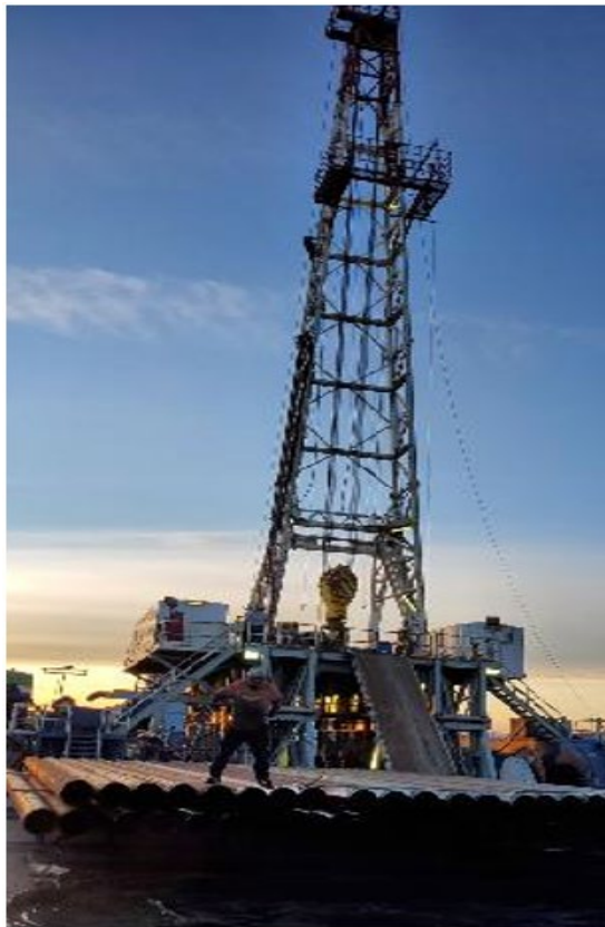
Fig. 1: 13 3/8" Casing now cemented to 1,828 Feet in Borba 1-7 Well

Sacgasco Limited (ASX: SGC) ("Sacgasco" or "the Company") is pleased to announce that 13 3/8" casing has been run and cemented at a depth of 1,828 feet as planned. Graham Rig 5 drilled to 1,828 feet in 17 1/2" hole out of the 20" conductor set at 50 feet.